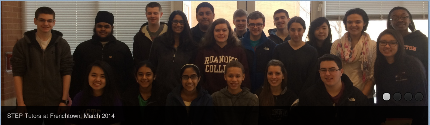
STEP Tutors at Frenchtown, March 2014