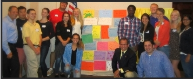
Peace Wall at the Interact-Rotaract Joint Assembly in recognition of International Day of Peace.